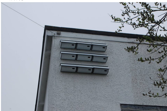
The new swiftboxes attached to the wall of the Co-op in the town.

This year saw Rang 6/7 children take part in a project in partnership with the Heart of The Glens Landscape Partnership Scheme and Moyle District Council Biodiversity Department to conserve and add to the pairs of swifts in and around Ballycastle. We thank the Challenge Fund for their generous funding. In February we saw a new Swift Tower installed and now we have distributed swift nestboxes, like the ones below, around the town and surrounding areas. We invited local representatives into the school where our fantastic pupils from Rang 6/7 gave an insightful and interesting presentation on their recent work.