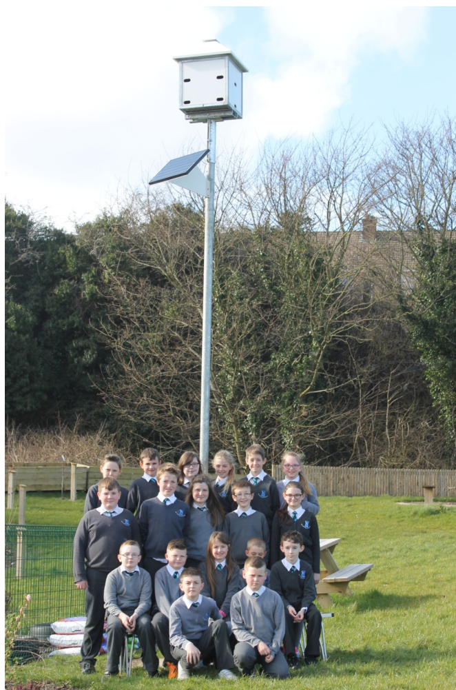
Rang 6/7 children at the newly installed swift tower at school.

Check out more great photographs on our Facebook page. Remember to 'like' and 'share' these with your friends.